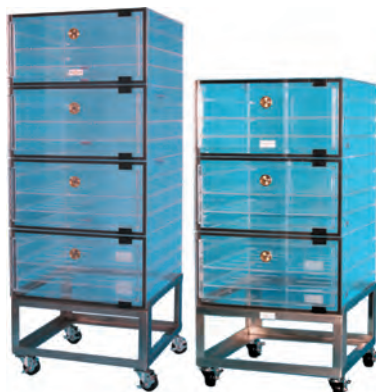
860-CG/4/NS & 860-CG/3/NS