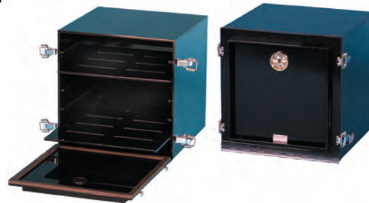
860-CGB/NS, Black Acrylic Desiccators