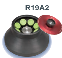
R19A2 @ 50,000Xg *with himac 50mL TC tubes!

About the use of conventional high-speed rotors with CR30NX, contact your nearest sales representative.