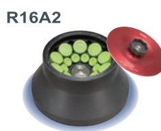
R16A2 @ 36,100Xg *with himac 50mL & 15mL TC tubes!